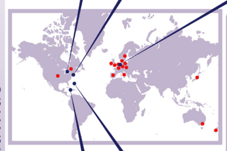
Customer Service and Design Service Operations Montego Bay, Jamaica Over 175 agents, operational 5 days per week, 16 hours per day